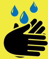
Wash or sanitise your hands before beginning your journey