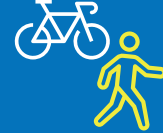
Walking and cycling