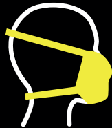
Use a face covering