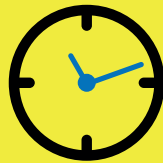
Can you travel off-peak?