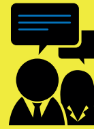
If you require assistance you should continue to request this as you normally would