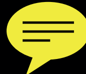
Be patient and follow instructions from transport staff