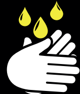
Wash or sanitise your hands as frequently as possible