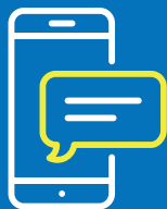
Follow guidance at your destination

When finishing your journey, you should: