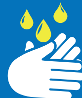
Wash or sanitise your hands as soon as possible