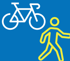
Walk and cycle from public transport to your destination, where possible